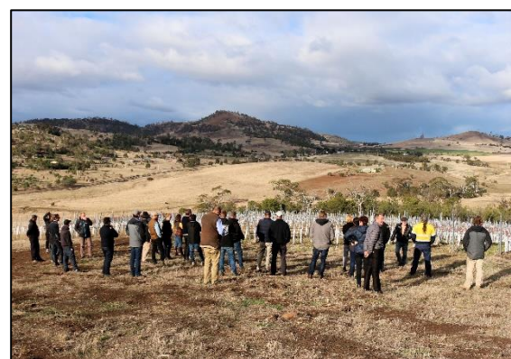
Photos from the 2018 and 2019 Vineyard of the Year Awards.