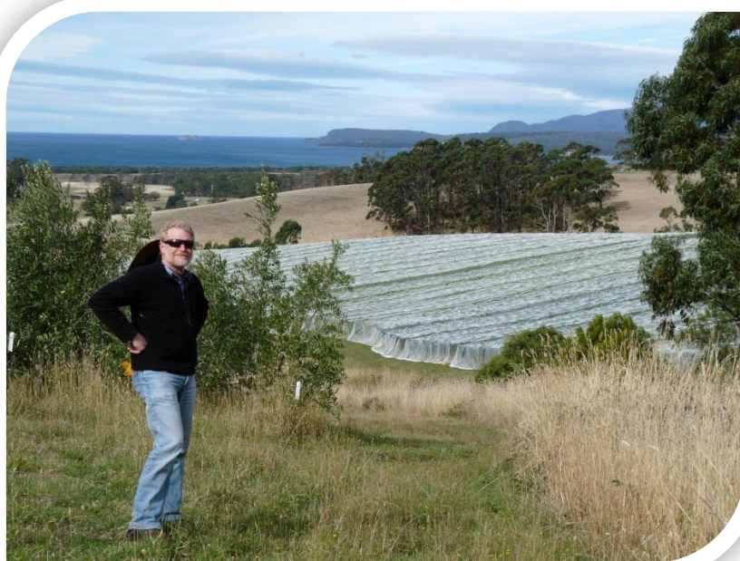
Cape Bernier Vineyard – Winner 2010

On site at the successful vineyard Thursday 24 May 2012.