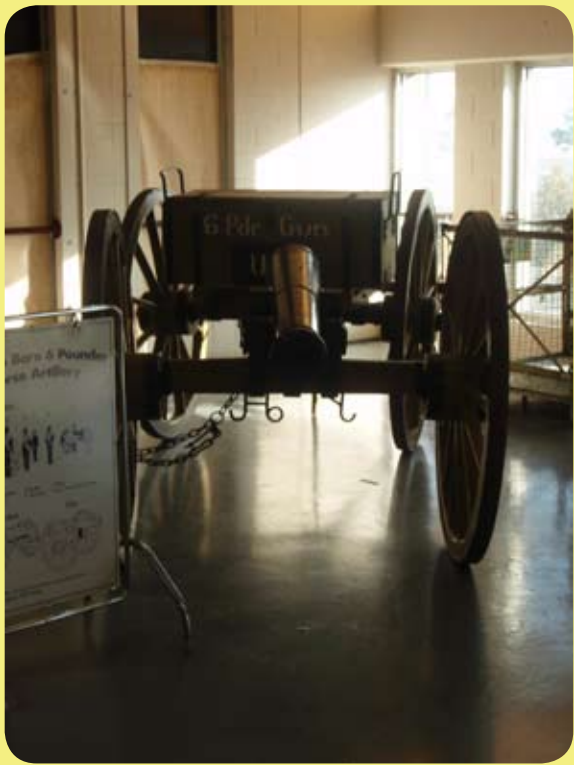
A 6lb gun on display at the Arms & Militaria Fair

The Tasmanian Vineyard of the Year Award is designed to encourage excellence in grape growing and vineyard management and focuses on viticulture as the single most important element in producing great wines. Entries in the Awards are judged on a number of criteria, including soil management, weed control, disease control, pruning, forming of the vine, trellising and water management.