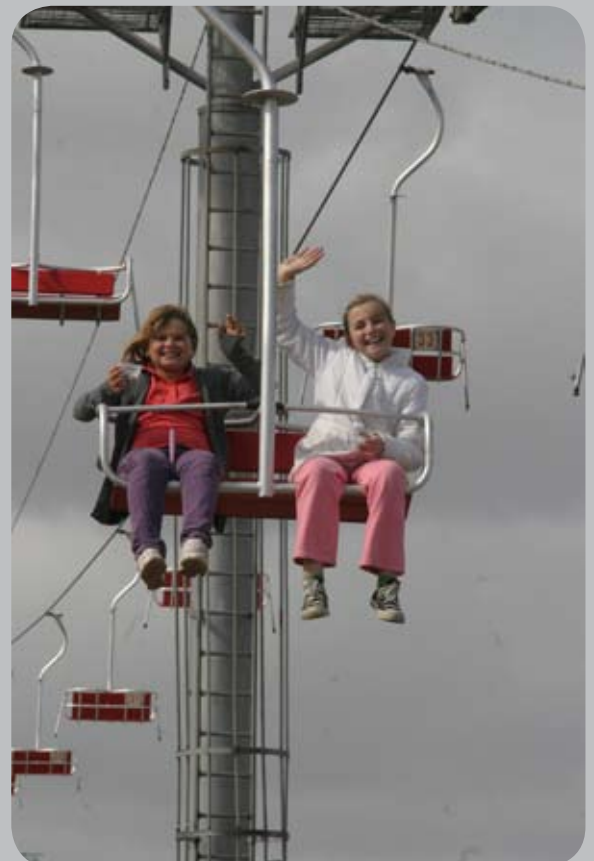
For Sale - one chairlift

THE Society also sends an advisory to media newsrooms once a month to let them know what's on at the Showground. Based on the advisory, news crews are often at the Showground, especially on a weekend, covering events taking place.